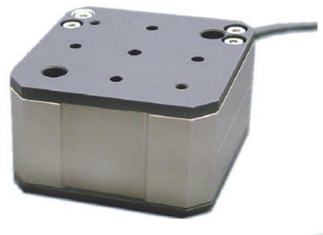
fig.: nanoX 400

So you easy can adapt the set up depending on the current load scenario and optimize the performance of the system.